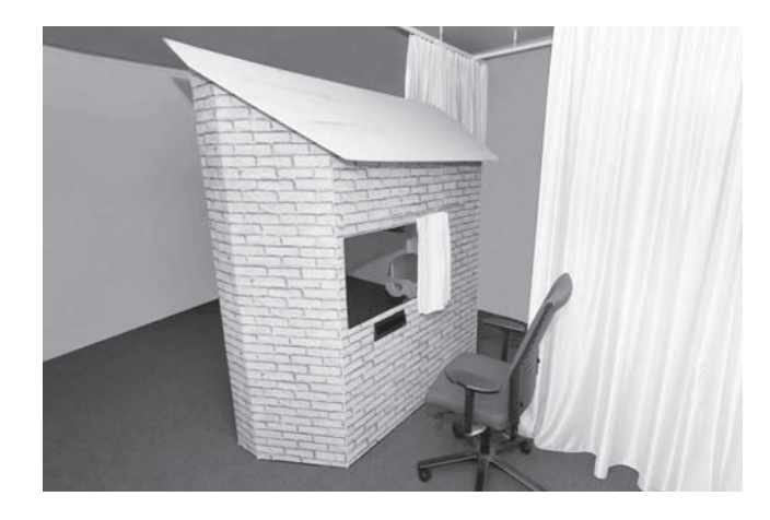
Fig. 1. House apparatus. While infants viewed video stimuli on a monitor placed in the window, their eyes were tracked by an eye tracker through a slit below the window.

The stimuli were shown at a monitor resolution of 1920 × 1080 pixels in the following order: an attention-grabbing animation (4 s), a gray screen (3 s), and an action stimulus showing an adult performing either an introductory action (21 s; introductory trial) or one of two test actions (33 s each; test trials). In the introductory trial, the action stimulus showed the adult playing a game without needing help. In the test trials, one of the two actions portrayed him stacking cans to form a tower. After 28 s, the adult dropped the last can on the ground, pretending the drop was accidental. In the other test trial, the